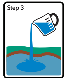
Step 3 Pour the product directly into the pond. (See "How to Use")