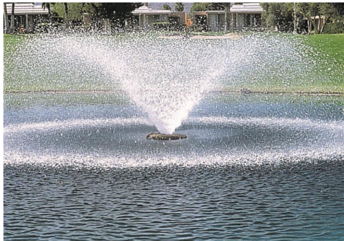
Figure 1. For use in: natural and manmade contained lakes and ponds (ornamental, recreational, fish bearing & fish farming bodies) with little or no out ow of water.