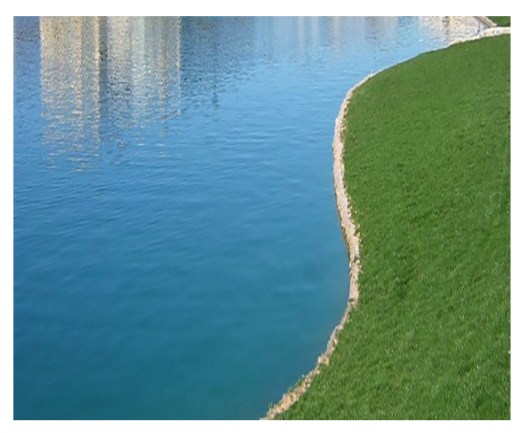
Figure 1. for use in lakes, ponds, and decorative water features with little or no overflow.