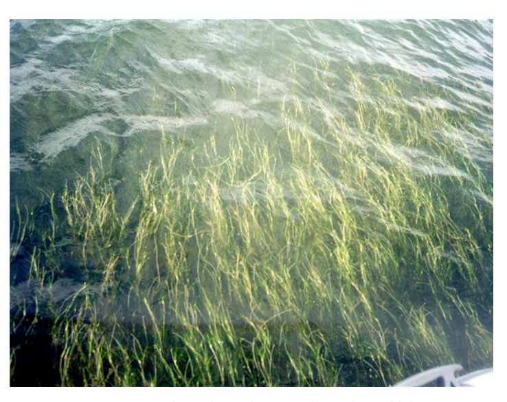
Figure 1. For use in residential ponds or small residential lakes in treatment of underwater weeds.