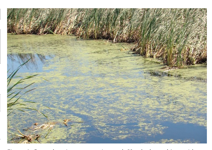
Figure 2. Controls nuisance aquatic weeds like duckweed (use with aquatic use surfactant).