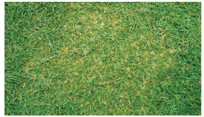
Figure 1. Cutless treated creeping bentgrass aggressively beginning to grow or "creep" into a suppressed Poa annua stand.