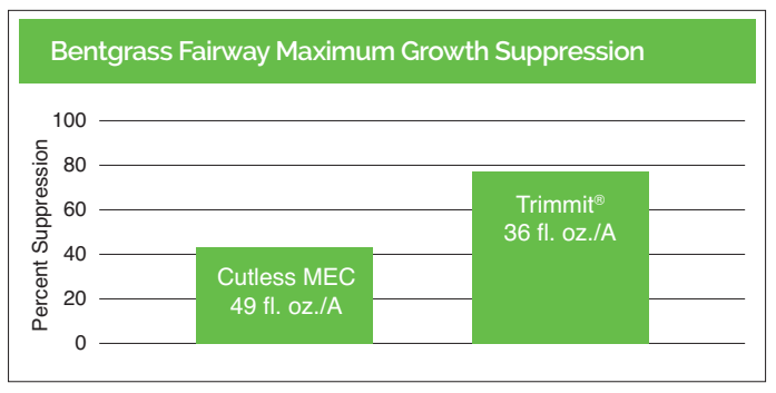
Figure 2. Maximum growth suppression of a bentgrass fairway following application of various plant growth regulators.

Cutless suppresses Poa annua growth more than creeping bentgrass and other desirable cool-season turfgrasses. This benefit allows turfgrass managers to shift the competitive growth advantage away from Poa annua to desirable turf with regular Cutless applications. In comparison to paclobutrazol, Cutless provides less growth regulation of desirable turf while providing the same degree of Poa annua growth regulation, making Cutless the premier conversion